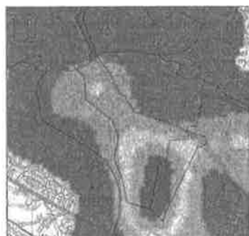
2014 – 2017 - All Nuisance Incidents Peak Time: 19:00 – 00:00 Risk days: Sat Top Streets: Brudenell Road, Cardigan Road, Hyde Park Road & Otley Road”

The geo-spatial analysis shown on page 26 shows: